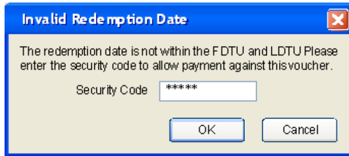
Figure 4 – Invalid Redemption Date Dialog

This dialog is used to prompt the user for the security code required to allow a voucher that has been redeemed either before the first date to use or after the last date to use to be added to the batch. This dialog is displayed from the Voucher dialog while attempting the save a voucher that has a redemption date that is either before the first date to use or after the last date to use of the voucher.